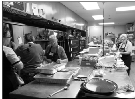
TWC volunteers on kitchen duty

Tinley Park - Kennootz Pizza - Labriola Baking Company - Little Joe's - Mama Vesuvio's East - Marcotte's - Nancy's Pizzeria - Nick's Barbeque - Olive Garden - Papa Joe's - Patio - Rich's Pizza Joint - Rubino's Italian Imports - Salina's Pasta & Pizza - Subway - Winston's Market