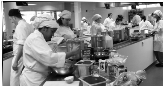
Robert Morris University students cook up recipes using TWC food pantry items.

Recipes will be distributed to clients and also available soon on www.togetherwecope.org .